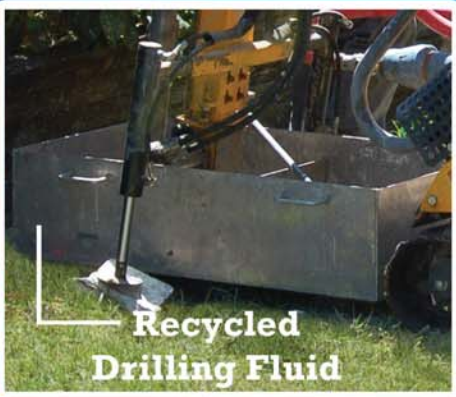
Recycled Drilling Fluid